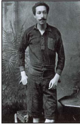
Arthur Wharton (1865 -1930) Preston North End, etc.