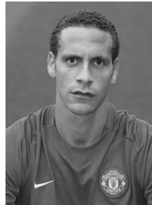
Rio Ferdinand b. 1978 Manchester United and England

The presence in Britain of people with an African or Caribbean origin has been a long-standing fact. Archeologists have found evidence, such as skulls, pointing to the presence of rich African families in Roman Britain, some 2000 years ago and there is documentary evidence of a black trumpeter in the court of the Tudor Kings.