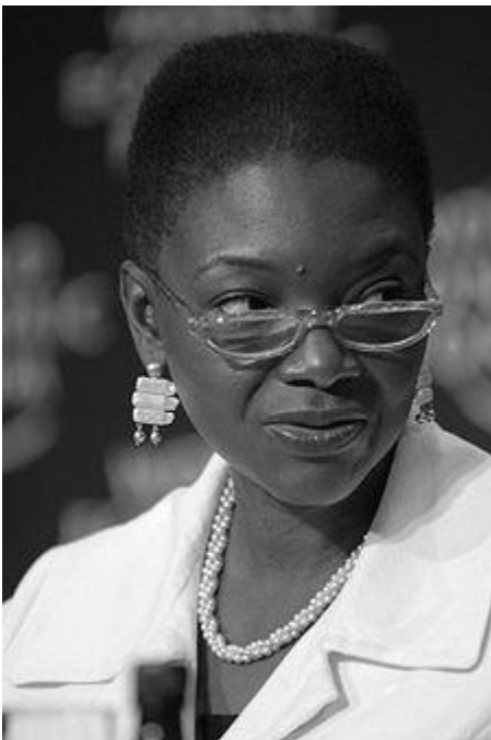
Valerie (Baroness) Amos, politician, first black Cabinet Member