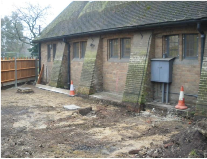
The old north wall before work for the new door