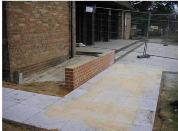
The ramp to the main door is in progress