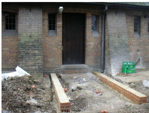
The ramp to the Parish Room door is in progress.