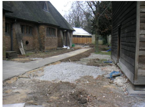
Looking in both a southerly and northerly direction from the entrance to the Parish Room