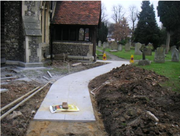
The path to the porch of the Old Church from the ramped path between the churches