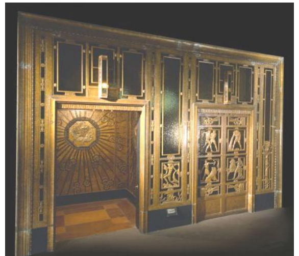
Selfridges lift, 1928