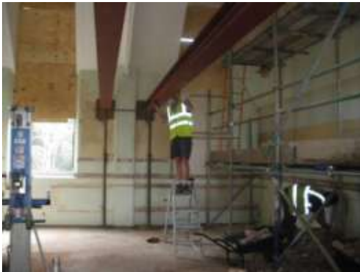
Steel girders put in place to support the new floor