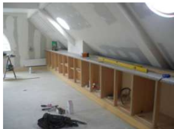
The new space starts to look like a classroom