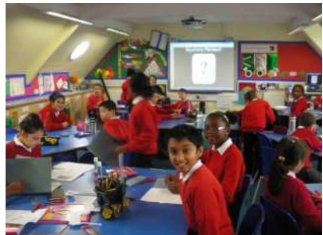
Tuesday 2nd November 2010, the children are now happily working in the new classrooms.