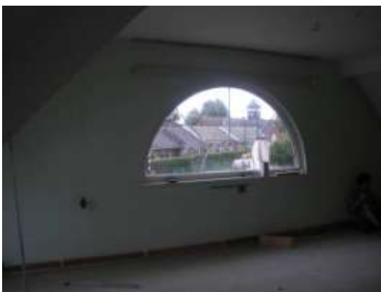
A view never seen before!