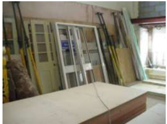
Former classroom space changing