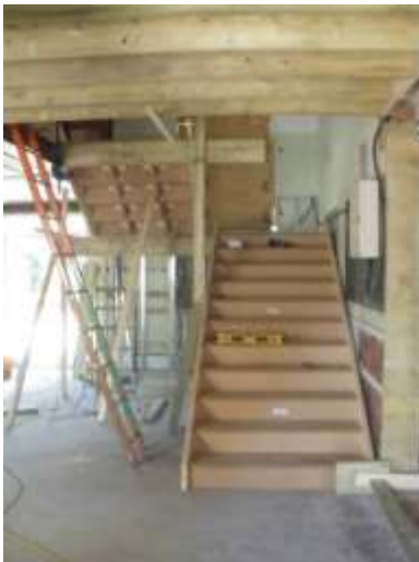
A new staircase under construction