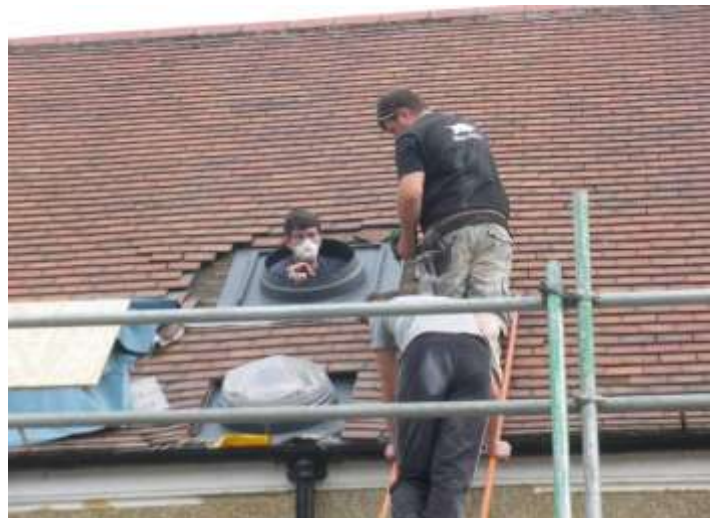
New holes are made to bring sunlight into a classroom