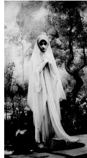
Annunciation Arthur Hacker 1858–1919

The incident in Jerusalem – when Jesus gets left behind and his parents have to return to find him;