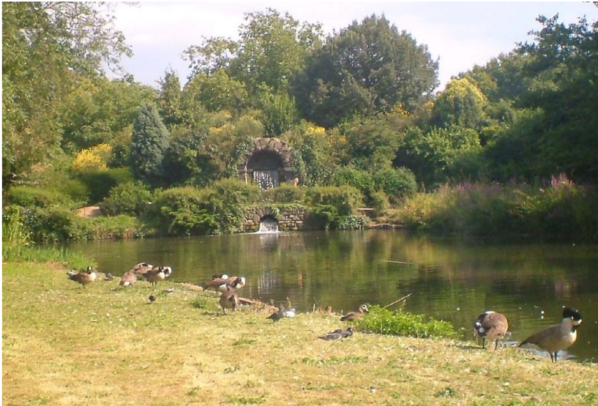
The Cascade in Chiswick House Grounds built in 1738