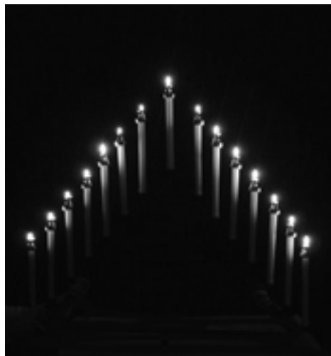
A Tenebrae candle holder