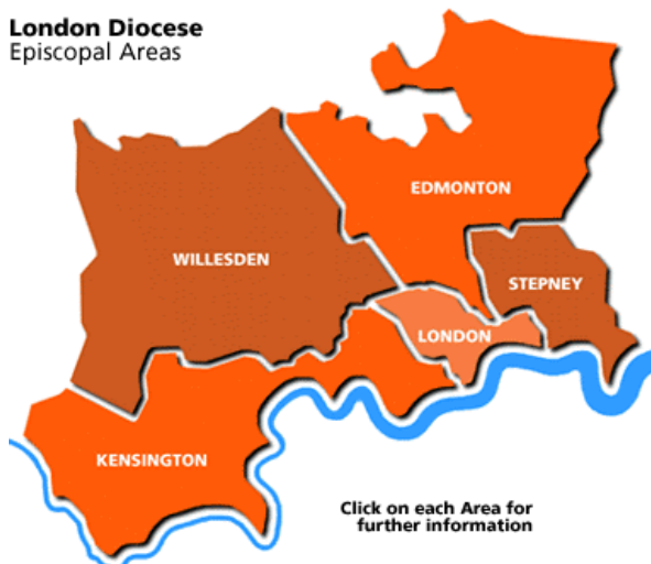
London Diocese Episcopal Areas

Click on each Area for further information