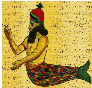
The false god Dagon

Dagon was the god of the Philistines. This image shows that the idol was represented in the combination of both man and fish. The name "Dagon" is derived from "dag" meaning "fish." His powers were believed to affect human reproduction and fertility.