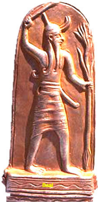
The false god Baal

The key to this commandment is that God is alone to be worshipped and that has implications for us because when we acknowledge the true and living God we are caught up in a holistic system which requires us to be faithful, loving, honest, just and peaceful. We are meshed into a sense of community with all other human beings in a solidarity which is universal and timeless. We recognise God as our maker and so we come to see each other as brothers and sisters, and we accept that we have responsibilities for each other. How these issues work out in practice will naturally feature in the later commandments.