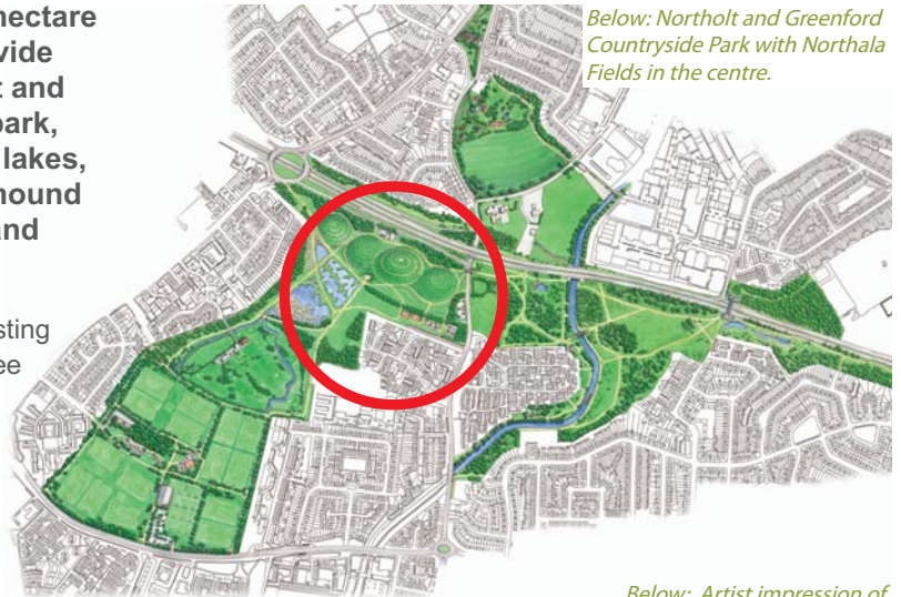
Below: Northolt and Greenford Countryside Park with Northala Fields in the centre.

The park will play an essential role in connecting existing facilities and features within the Countryside Park (see right) and providing new recreational, social, cultural and sporting opportunities for park users to enjoy.