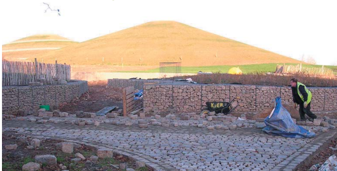
Below: Creation of Kensington Road entrance with Mounds 3 & 4 behind.