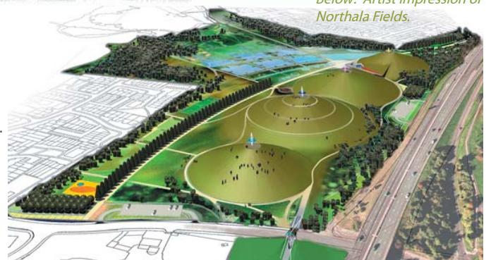
Below: Artist impression of Northala Fields.

By November 2006 approximately 60,000 truck loads of waste (uncontaminated material) had been deposited to create the 4 mounds at Northala Fields. Material importation has recently concentrated on the two western mounds nearest to the Target Roundabout. Only a few hundred lorry loads of material remains to be imported and the 'tip' will be closed by Christmas. Once the mounds are at finished level they are topdressed with subsoil, to enable wild meadow flowers to establish and give each mound its own character and identity. Mounds 3 and 4 were seeded over summer and both showing signs of growth.