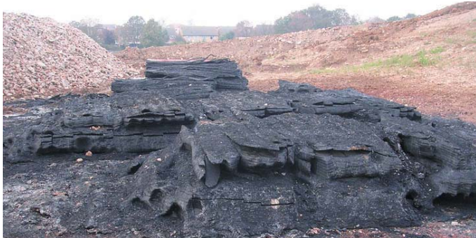
Above: Vandalism of stockpiled recycled plastic edging in early November, costing the contractor a £23k insurance claim.