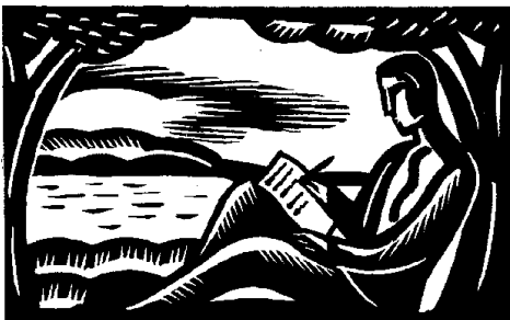
ILLUSTRATION BY ANTHONY RUSSO

There are many ways to do it and many places where you may feel inspired to do it and many of you who can and should do it!