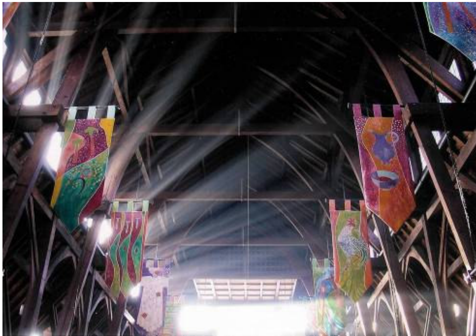
Ray s of light shine through into the New Church